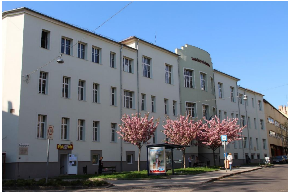
The faculty's building