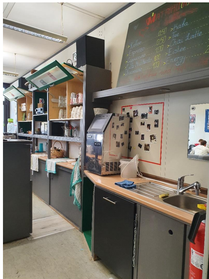
On campus coffee shop operated by university students.